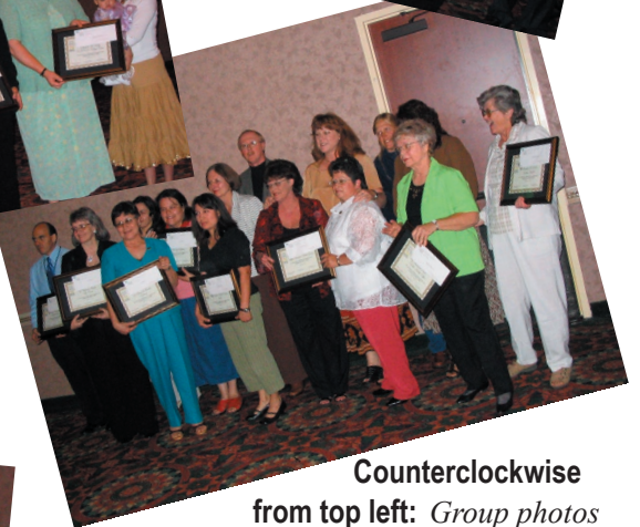
Counterclockwise from top left: Group photos of some of this year's award winners from the NMIC Provider Awards Dinner on April 28: Our three immunization champions, Region 1 award winners, Region 2 award winners, Region 3 award winners, Region 5 award winners and Region 4 award winners.