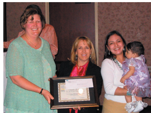
Representatives from Rehoboth McKinley Christian Health Center College Clinic receive their award, being given to them by New Mexico Secretary of Health Michelle Lujan Grisham (middle), for achieving an immunization rate over 90%

9/21, NMIC Steering Committee meeting, 2:30-4:30